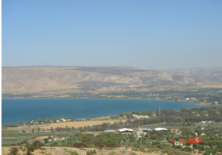
Southern Kinneret and Golan. Syrian artillery emplacements on Golan fire at Israeli civilian targets below. Adrian Wolff

1967 Syrians January to April 1967, Syrians continue to fire artillery, mortar and machine-guns at Israeli villages, farmers, fishermen and fields in Upper Galilee and Kinneret areas. This includes heavy shelling on 14 April of Kibbutz Ha'on on the eastern shores of Kinneret.