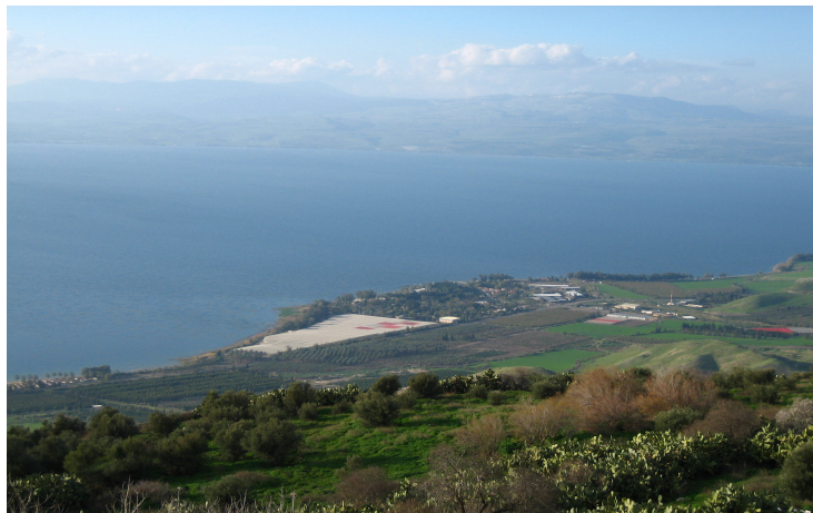
View of Kibbutz Ein Gev from Syrian Artillery camp on Golan overlooking the Kinneret.

1967 Syrians Syria plans without an operational date Operation Amalita Saddam to capture the Upper Galilee. On 12 May 1967 Syrians open fire on tractor operators in fields of Kibbutz Tel Katzir, Ha'on and Ein Gev in southeast Kinneret. Later that day an aerial combat results in Syrian aircraft losses 6, Israeli 0.